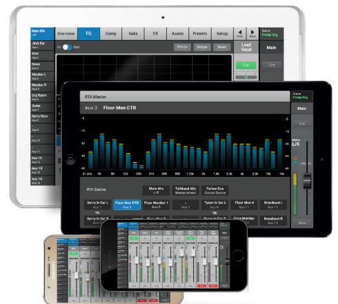
TouchMix Control App for iOS® and Android™ devices

Modern digital mixing consoles are all fully featured — sometimes to the point of being nearly incomprehensible to all but the most experienced operator. The TouchMix design team set out from the start to create a mixer with an intuitive workflow and straightforward navigation that is understandable for the less experienced user and fast for the professional — all without sacrificing features or capabilities. As a result, the mixer is extremely easy to learn and operate. Many TouchMix functions such as EQ, compressors, gates and limiters offer a choice of Advanced Mode operation with total control over all parameters or Simple Mode that presents only the most essential controls.