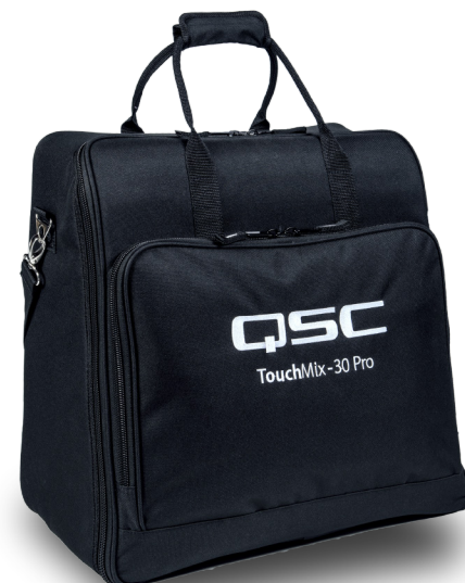
TouchMix-30 Pro Tote