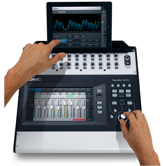
Shown with optional Tablet Support Stand and iPad® (not included)